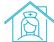
post-surgery home nursing