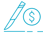
inpatient and outpatient surgical expenses